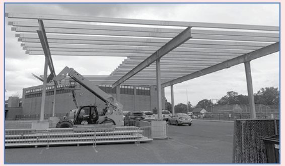
Construction of steel structures is underway at MacArthur High School.

Levittown Public Schools continues to make strides in environmentally friendly initiatives after recently breaking ground on its eagerly awaited energy performance project. Although the entirety of the project will see upgrades and improvements completed in several different trade areas, the most visually notable will be the installation of solar carports at several of our school buildings.