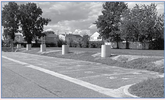
Concrete footings are the first step in erecting solar arrays at our schools.